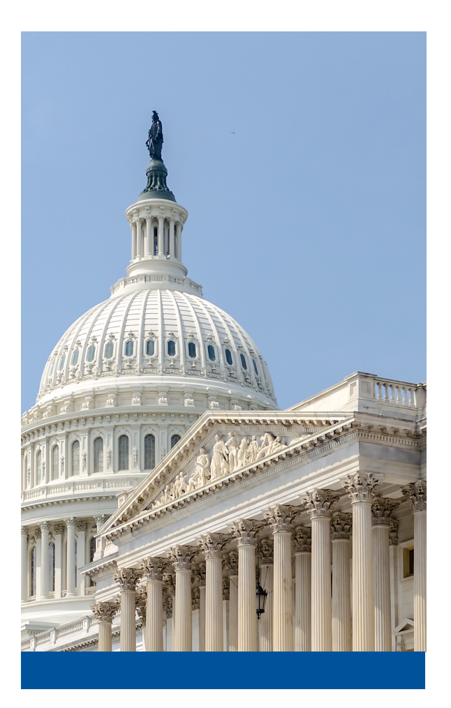
All of the GEO PAC's filings with the FEC are available for public review on the FEC's website at <u>www.fec.gov</u>.

All GEO PAC contributions must be approved by the GEO PAC board of directors. Detailed information on the GEO PAC's contributions to candidate campaigns and other political committees is publicly disclosed in the GEO PAC's regular reports to the Federal Election Commission ("FEC"). Disbursements from the PAC to state-level candidates and committees are also reported on these FEC filings.